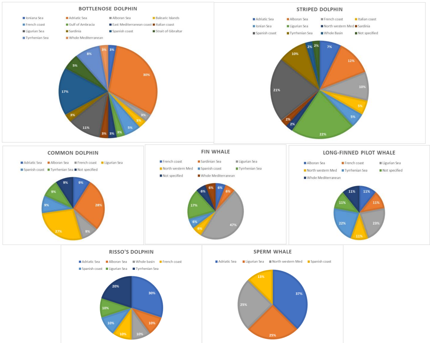
Figure 1. Analysis of spatial distribution of the studies on contaminants for the most studied cetacean species in the Mediterranean Sea.

Regarding the following species, only few records are present in literature: