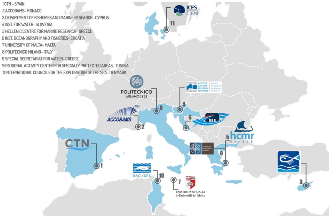
Figure 1. QUIETMED 2 Consortium

During the execution of the different activities, ACCOBAMS is assisted by the team of SINAY, a French company specialist of underwater noise and marine environmental studies, whose members are part of the Joint CMS/ACCOBAMS/ASCOBANS Working Group on Noise.